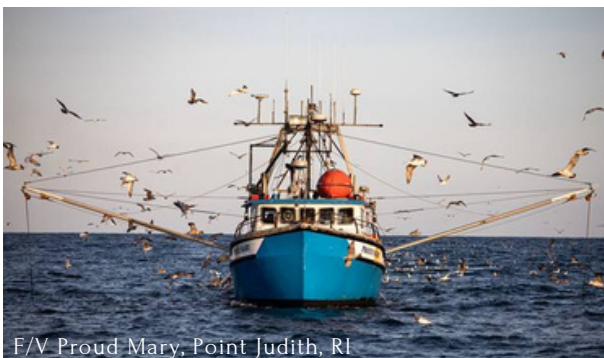
F/V Proud Mary, Point Judith, RI

Harvesters is a member of the Diesel Emissions Reduction Act (DERA) Coalition, a group that advocates for authorization and appropriations for DERA. After many months of meetings and advocacy, the Diesel Emissions Reduction Act was reauthorized through 2024 as part of the “Coronavirus” package (a combination of Coronavirus relief provisions and Omnibus appropriations bill) that passed Congress at the end of 2020.