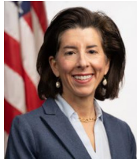
Secretary Gina Raimondo

On March 2, the Senate confirmed Gov. Gina Raimondo (D-RI) to be the next Secretary of Commerce. As the former Governor of Rhode Island, a state where commercial fishing is a large economic driver, Secretary Raimondo is keenly aware of the challenges facing the commercial fishing industry, including balancing offshore wind interests with the needs of the fishing industry. We look forward to a collaborative and productive working relationship with Secretary Raimondo.