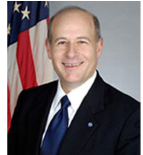
NOAA Administrator nominee, Dr. Rick Spinrad

On April 22, President Biden nominated Dr. Rick Spinrad, an experienced oceanographer, to lead NOAA, and Monica Medina was nominated to serve as the Assistant Secretary for the State Department’s Bureau of Oceans and International Environmental and Science Affairs (OES).